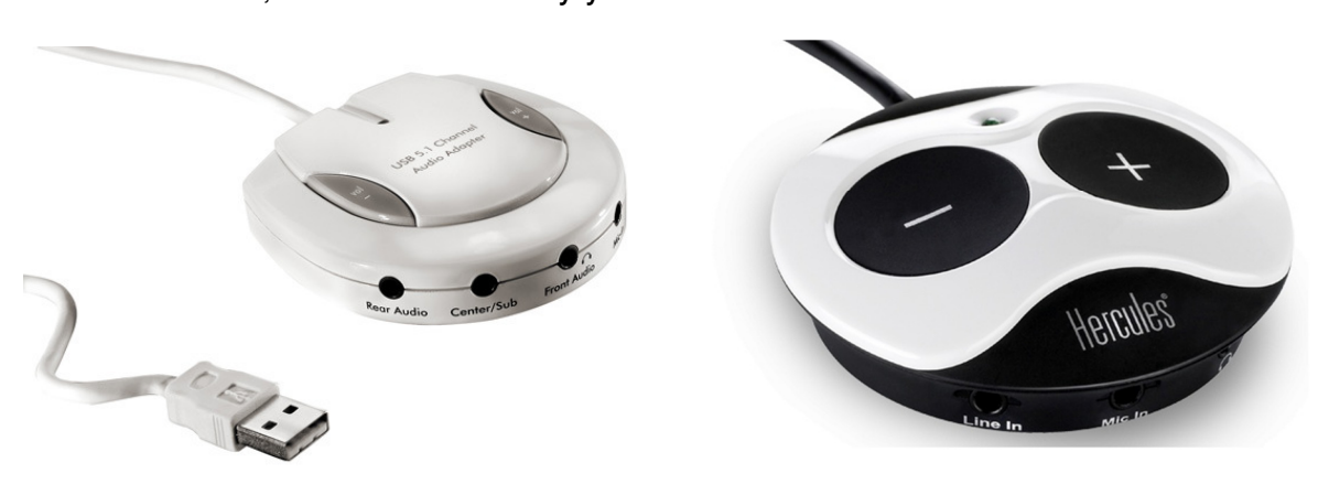
Muse Pocket LT

Before we start, we need to identify your model: